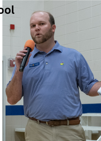
Comedy for a Cause