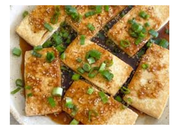
Tofu, a popular plant-based protein made from soybeans, offers several health benefits