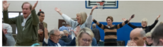
Dancing to Get the Meeting Started