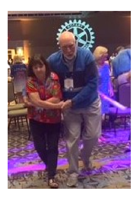
First Timers at District Conference